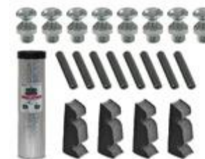
PC200i Spare Parts Kit (21053596)