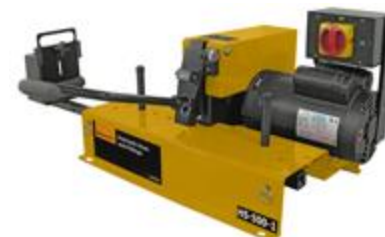
HS-501 Saw (20614557)