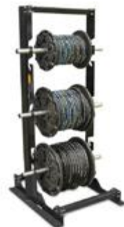
36" Hose Rack (21024823)