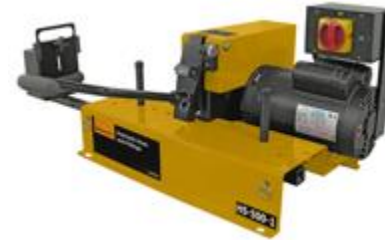
HS-501 Saw (20614557)