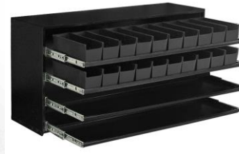
Hydraulic Fittings Bin (20240780)