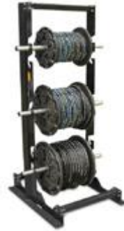
36" Hose Rack (21024823)