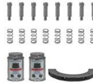
PC150 Spare Parts Kit (21053594)