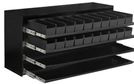
Hydraulic Fittings Bin (20240780)